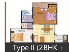
Type II (2BHK +)