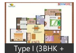
Type I (3BHK +)