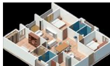
Apartments - 3 BHK