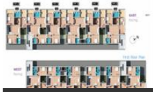
Duplexes - First Site