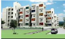
Duplexes - Road