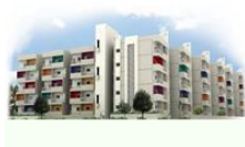
Apartments - Aerial