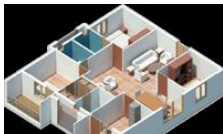
Apartments - 3 BHK