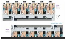
Duplexes - Second