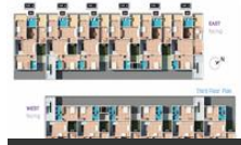
Duplexes - Third