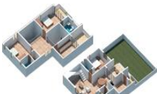
East Facing Duplex