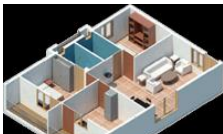
Apartments - 2 BHK