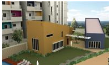
Duplexes - Garden