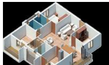
Apartments - 3 BHK