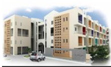
Duplexes - Front