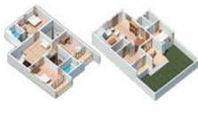
West Facing Duplex