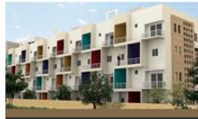
Duplexes - Balcony