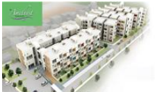
Duplexes - Bird's