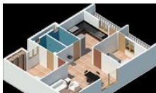
Apartments - 2 BHK