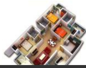
1394 sq. ft. Floor