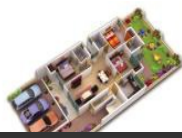
2493 sq. ft. Floor