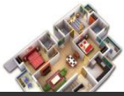
1394 Sq. ft. Floor