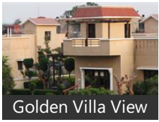
Golden Villa View