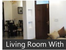
Living Room With