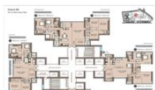
Typical Floor Plan-C