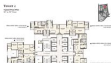
Typical Floor Plan-B