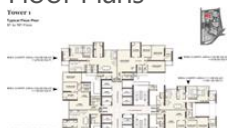
Typical Floor plan-A