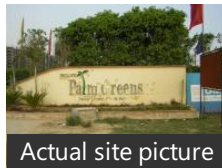
Actual site picture