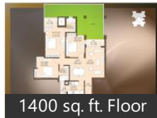
1400 sq. ft. Floor