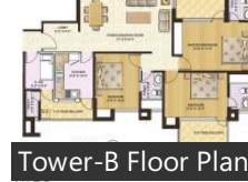
Tower-B Floor Plan