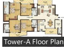
Tower-A Floor Plan