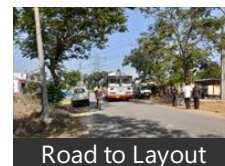
Road to Layout