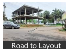
Road to Layout