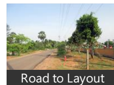
Road to Layout