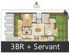
3BR + Servant