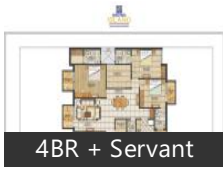
4BR + Servant