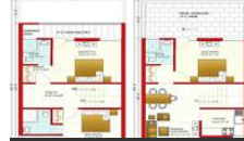
Floor Plan 3