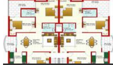
Floor Plan 2