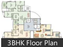
3BHK Floor Plan