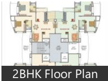
2BHK Floor Plan