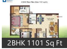
2BHK 1101 Sq Ft