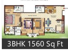
3BHK 1560 Sq Ft