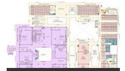
Fourth Floor Plan

* These floor plans are of the project and might not represent the property