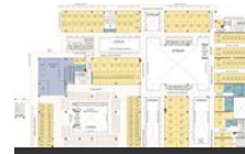
Third Floor Plan