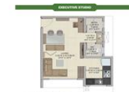
Studio Floor Plan

Panvel is now travelling towards growth & prosperity. Mix culture you can find here, Villagers Old customs as well as newly growing city's new Culture. A fresh & pollute free air is the main reason to live here connectivity & growing urbanization is next reason. Its a superb destination.