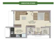
Studio Floor Plan