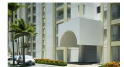
Road Side View