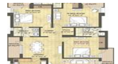
3 Bedroom +