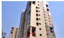
The Luxury Tower