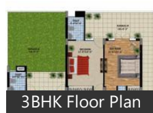
3BHK Floor Plan