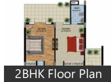
2BHK Floor Plan