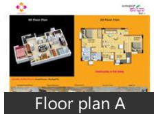
Floor plan A