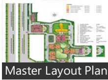
Master Layout Plan