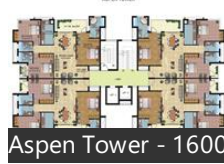
Aspen Tower - 1600