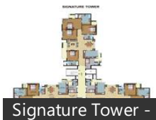
Signature Tower -