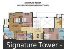
Signature Tower -