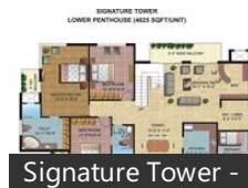
Signature Tower -