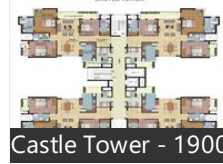
Castle Tower - 1900