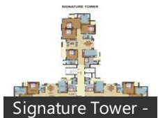
Signature Tower -