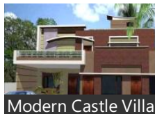
Modern Castle Villa