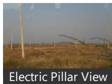
Electric Pillar View