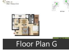
Floor Plan G