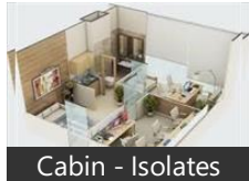
Cabin - Isolates