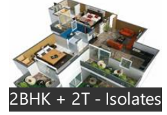
2BHK + 2T - Isolates