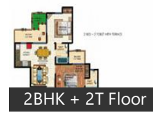
2BHK + 2T Floor