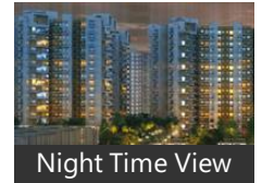
Night Time View