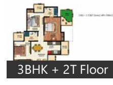
3BHK + 2T Floor