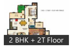
2 BHK + 2T Floor

* These floor plans are of the project and might not represent the property