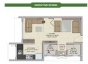
Studio Floor Plan