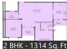
2 BHK - 1314 Sq. Ft.