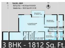
3 BHK - 1812 Sq. Ft.