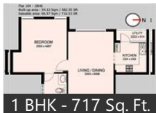
1 BHK - 717 Sq. Ft.