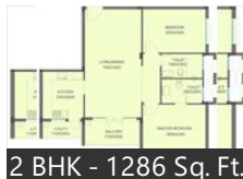
2 BHK - 1286 Sq. Ft.