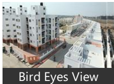
Bird Eyes View