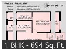
1 BHK - 694 Sq. Ft.