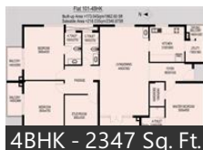
4BHK - 2347 Sq. Ft.