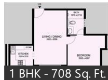
1 BHK - 708 Sq. Ft.