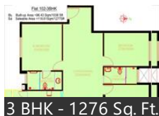
3 BHK - 1276 Sq. Ft.