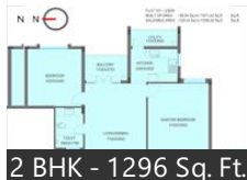
2 BHK - 1296 Sq. Ft.