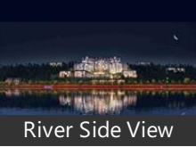
River Side View