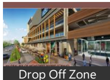
Drop Off Zone