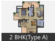
2 BHK(Type A)