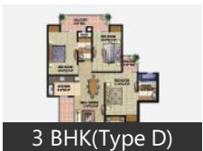
3 BHK(Type D)