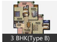
3 BHK(Type B)