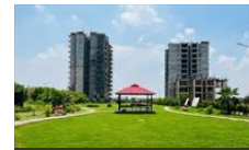
Leela Orchid Greens