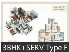
3BHK+SERV Type F