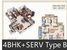
4BHK+SERV Type B