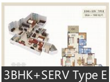
3BHK+SERV Type E