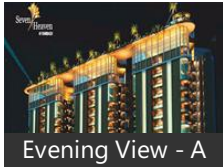
Evening View - A