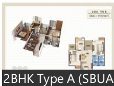
2BHK Type A (SBUA)