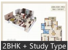
2BHK + Study Type