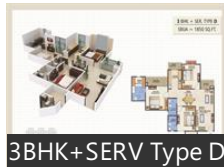
3BHK+SERV Type D