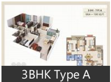
3BHK Type A