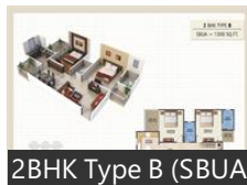
2BHK Type B (SBUA)