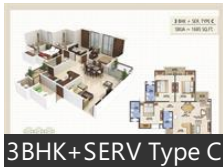
3BHK+SERV Type C