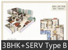
3BHK+SERV Type B