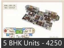
5 BHK Units - 4250