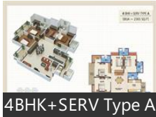
4BHK+SERV Type A