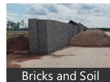
Bricks and Soil