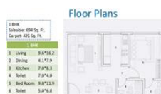
Floor Plan-1 BHK