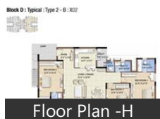
Floor Plan -H