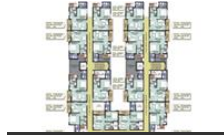
565 Sq Ft-Typical