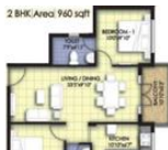
960 Sq Ft