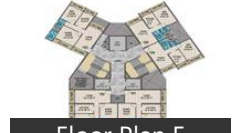
Floor Plan E

* These floor plans are of the project and might not represent the property