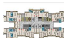
Floor plan B