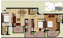
3BHK Floor Plan