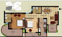
2BHK Floor Plan