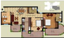
2BHK+ Study Floor