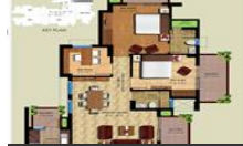
4BHK Floor Plan