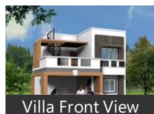
Villa Front View