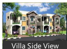
Villa Side View