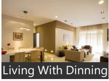
Living With Dining