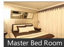
Master Bed Room

* These pictures are of the project and might not represent the property