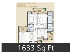
1633 Sq Ft