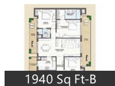
1940 Sq Ft-B