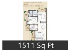
1511 Sq Ft