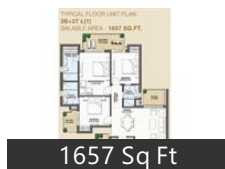
1657 Sq Ft