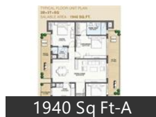
1940 Sq Ft-A