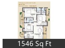
1546 Sq Ft