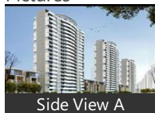
Side View A