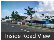
Inside Road View