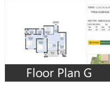
Floor Plan G