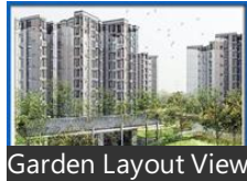
Garden Layout View