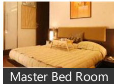
Master Bed Room