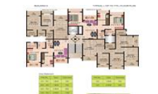
Typical 1 to 7 Floor