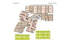
Building 6 - Ground