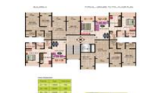
Building 8 Typical