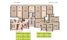
1, 3 BHK - Ground