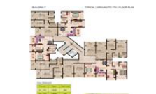
Building 7 Typical