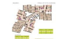
Building 6 Typical