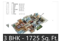
3 BHK - 1725 Sq. Ft.