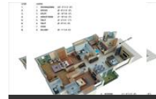
3 BHK - 1900 Sq. Ft.