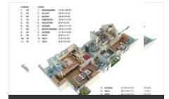
4BHK - 2625 Sq. Ft.

* These floor plans are of the project and might not represent the property