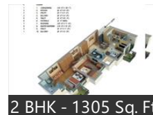
2 BHK - 1305 Sq. Ft.