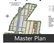
* These floor plans are of the project and might not represent the property