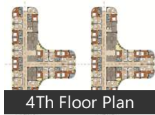
4Th Floor Plan