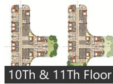
10Th & 11Th Floor