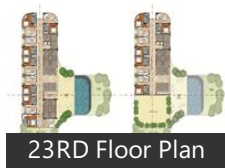
23RD Floor Plan