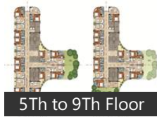
5Th to 9Th Floor