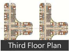
Third Floor Plan