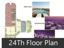
24Th Floor Plan