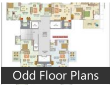
Odd Floor Plans