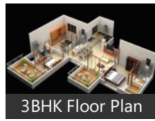
3BHK Floor Plan